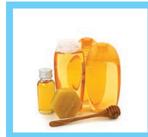
Valuable Essential Oil