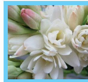
Double Flowered Tuberose close-up