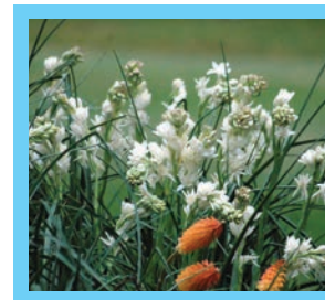
Tuberose in Bloom late August