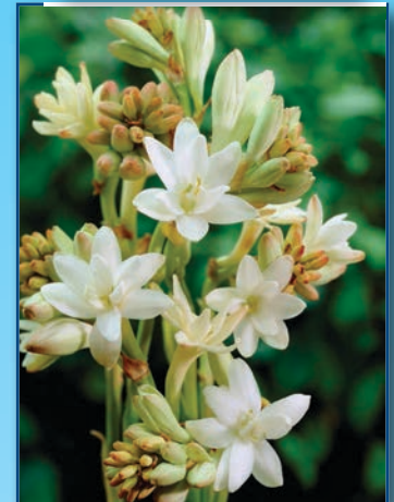
Double Pearl Tuberoses ( Polianthes tuberosa hybrids)