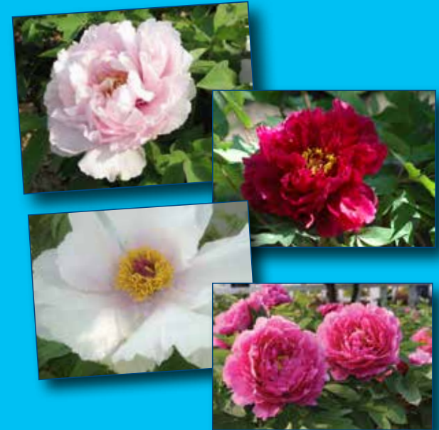
Tree Peony (Paeonia suffruticosa)

ROBERTA'S GARDENS PLANTING AND GROWING GUIDE