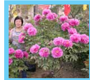
Happy Luxuriant Pink 4 to 5 years old