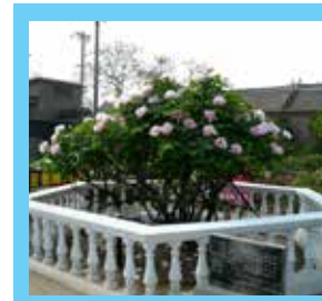
Garden Jade Light Pink 100 years old