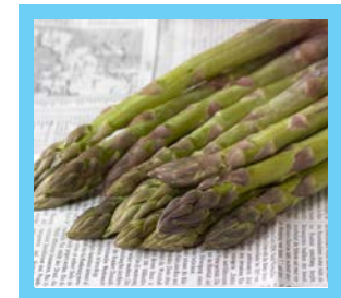
This all male hybrid is long-lived while producing large harvests