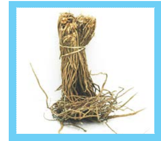
Asparagus Shipped as Shown