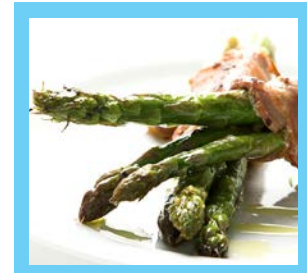
Flavorful Jersey Knight is absolutely delicious