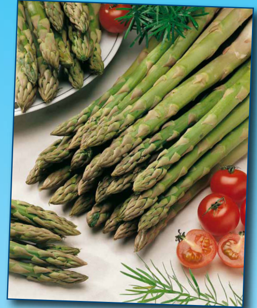
Jersey Knight Asparagus ( Asparagus officinalis hybrid)