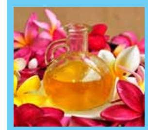
Plumeria and coconut oil