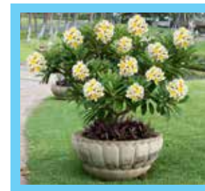
Kona Yellow in its 5th year