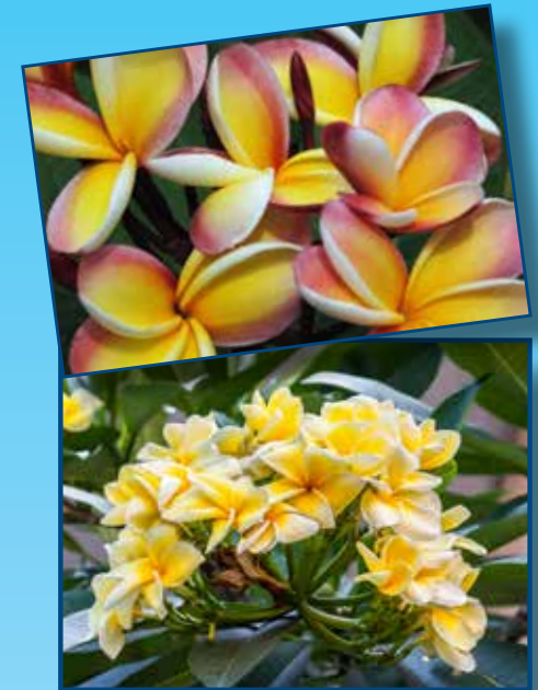
Hawaiian Plumeria With Fertilizer (Plumeria rubra)