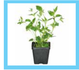
Agastache Shipped As Shown