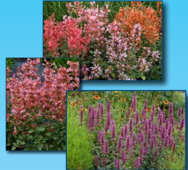
Kudo Series Humdingers Agastache (Agastache hybrids)