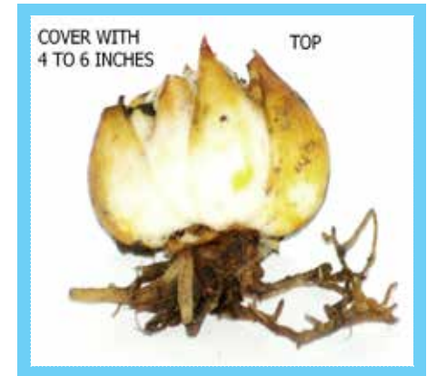
Lilium Shipped As Shown