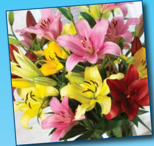
Lily Collection (Lilium hybrids)