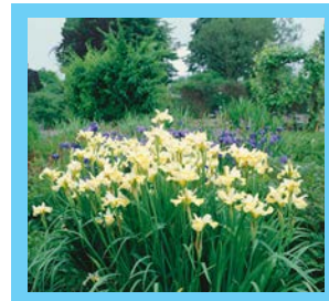
Butter and Sugar spreading nicely