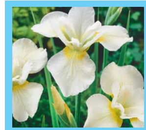
Soft tones of Harpswell Happiness