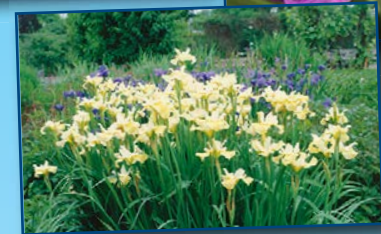
Siberian Iris (Iris siberica hybrids)