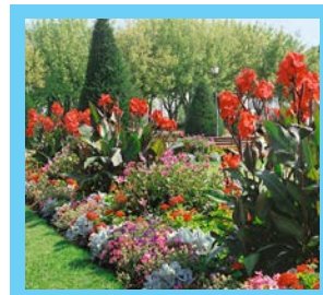
Well-suited for the backside of sunny gardens or borders