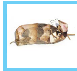
Canna Shipped as Shown