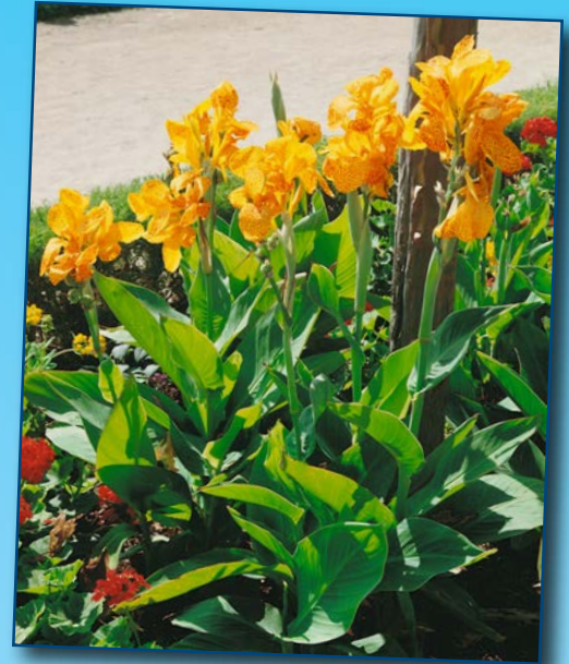
Canna Lily (Canna Hybrids)