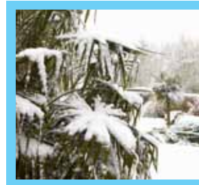
Mature 5 Year Old Windmill Palm