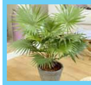
Established 1 Year Old Windmill Palm