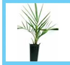
Windmill Palm Shipped As Shown