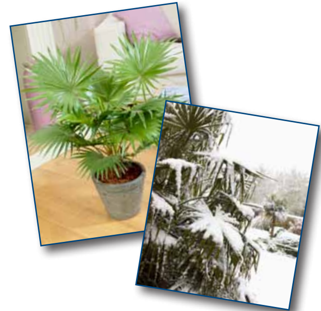
Hardy Windmill Palm ( Trachycarpus fortunei )